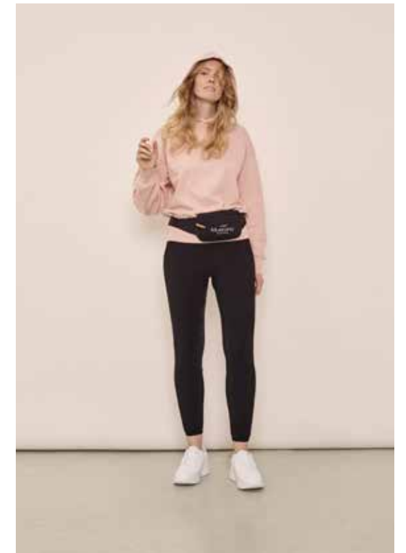
Melisa Sweatshirt, Mila Full Seat Breeches, Mali Bag