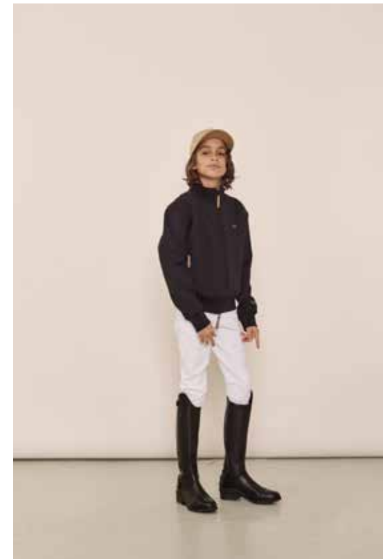
Maxx Jr. Soft Shell Jacket, Maya Jr. Knee Grip Breeches, Mo Cap