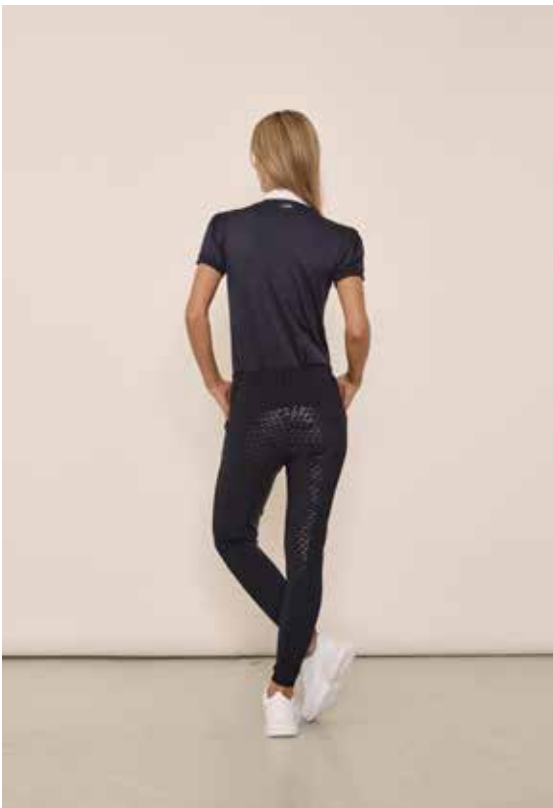
Malina Competition Polo Shirt, Mila Full Grip Breeches