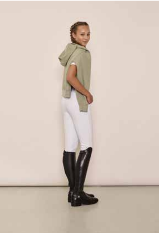
Melisa Sweatshirt, Mila Knee Grip Breeches