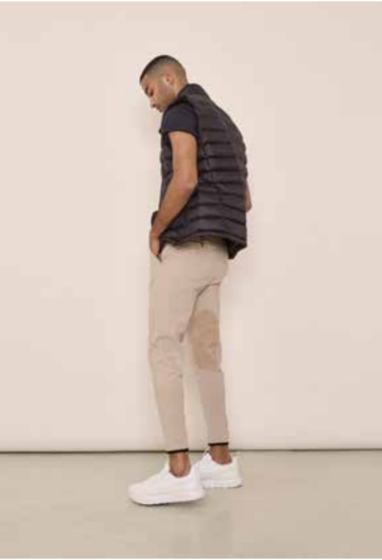
Mark Down Vest , Mustang Unisex T-shirt, Michael Knee Patch Breeches