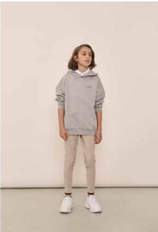
Marley Jr. Sweatshirt, Maya Jr. Full Grip Breeches