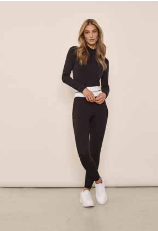
Muse Tech T-shirt, Mia Knee Grip Tights