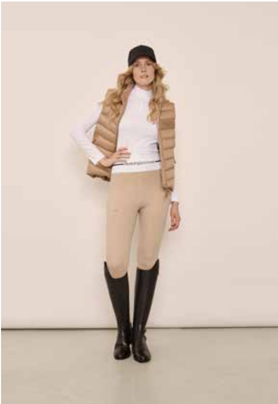
Mica Down Vest, Muse Tech T-shirt, Mia Knee Grip Tights, Mo Cap