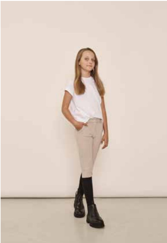
Mustang Jr. T-shirt, Maya Jr. Knee Grip Breeches, Milo Socks