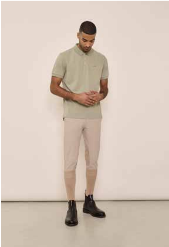
Martin Polo Shirt, Michael Knee Breeches