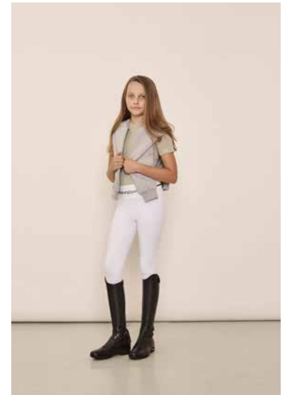
Maggy Jr. Seamless T-shirt, Merle Jr. Knee Grip Tights, Marley Jr. Sweatshirt,