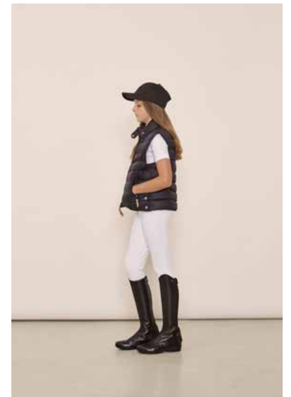
Mischa Jr. Down Vest, Maggy Jr. Seamless T-shirt, Merle Jr. Knee Grip Tights, Mo Cap