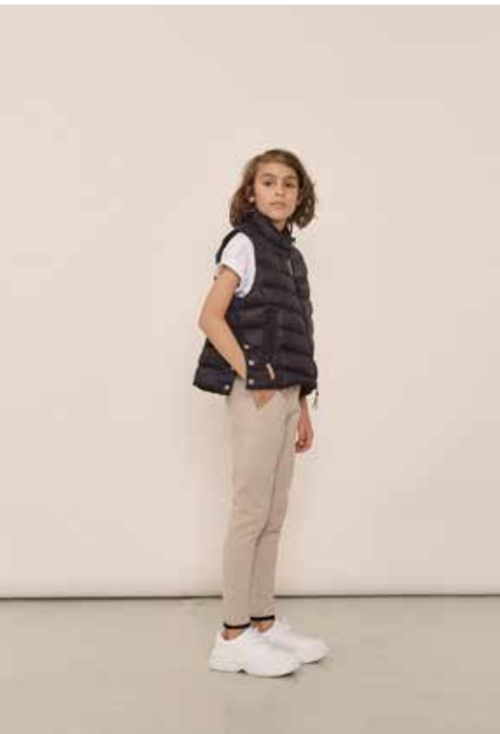
Mischa Jr. Down Vest, Mustang Jr. T-shirt, Maya Jr. Full Grip Breeches