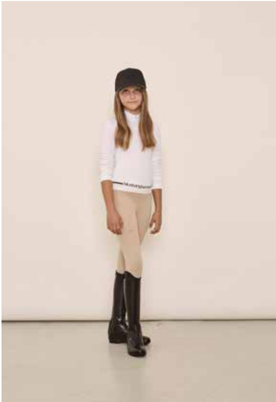
Miguel Jr. Tech T-shirt, Merle Jr. Knee Grip Tights