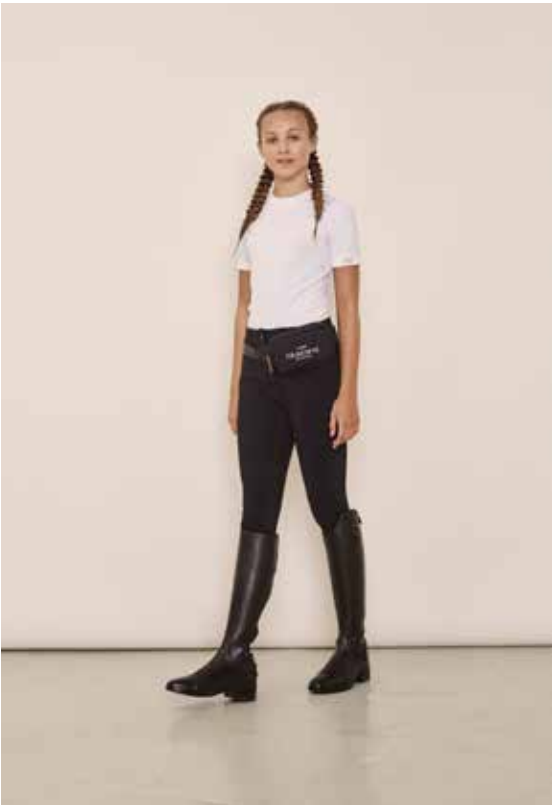
Malin Tech T-shirt, Maria Full Seat Breeches, Mali Bag