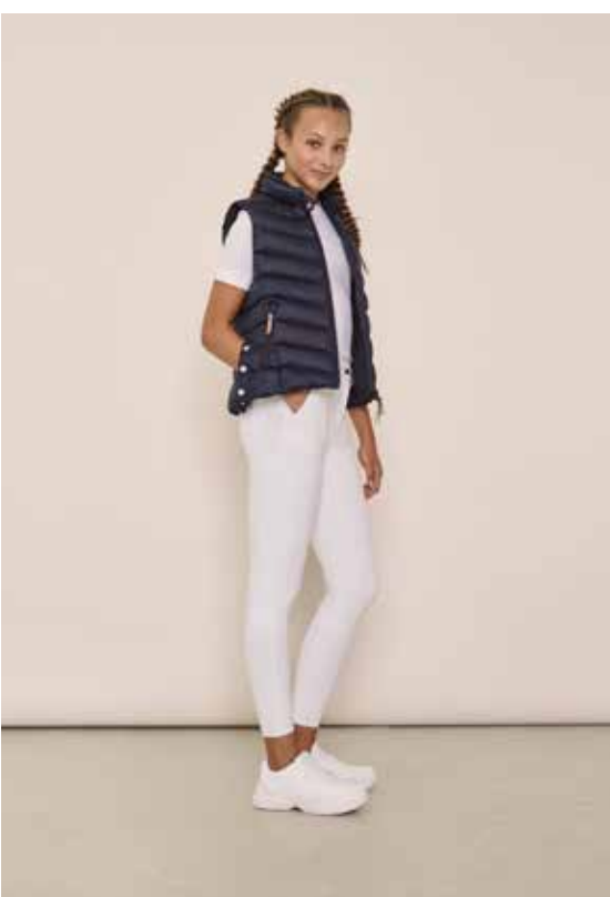
Mica Down Vest, Mustang Unisex T-shirt, Mila Full Grip Breeches