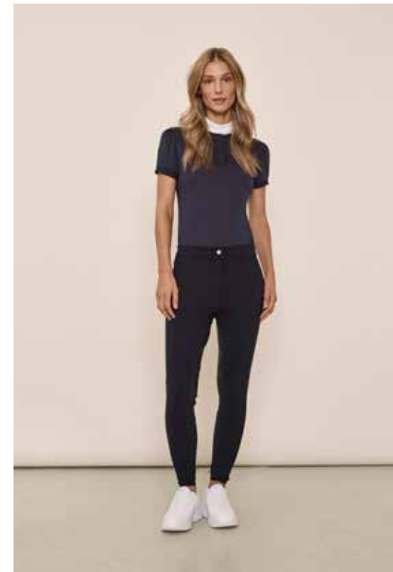
Malina Competition Polo Shirt, Mila Full Grip Breeches