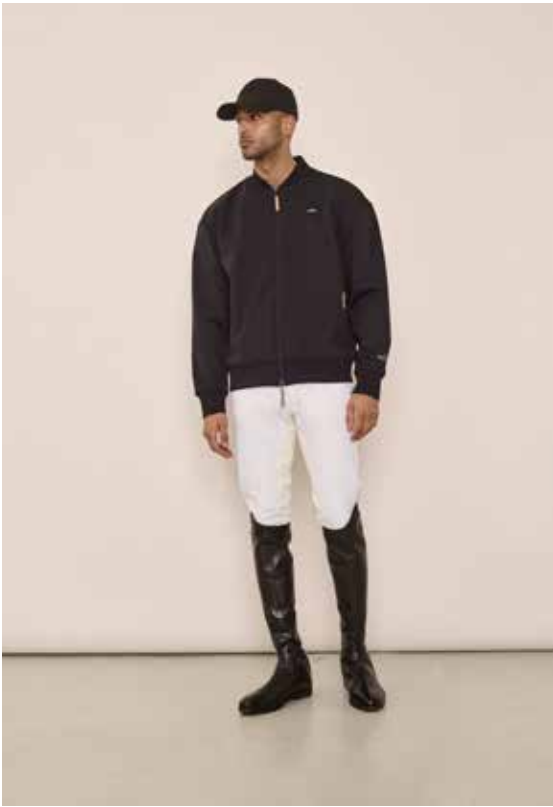
Mateo Soft Shell Jacket, Michael Full Seat Breeches, Mo Cap