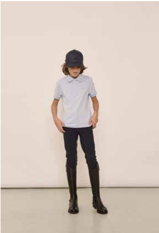
Malkit Jr. Polo Shirt, Maya Jr. Full Grip Breeches, Mo Cap