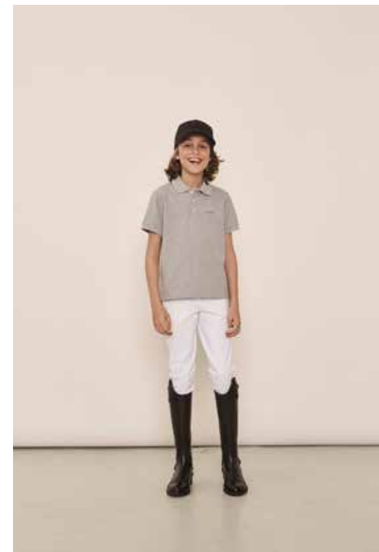
Miles Jr. Polo Shirt, Maya Jr. Knee Grip Breeches, Mo Cap