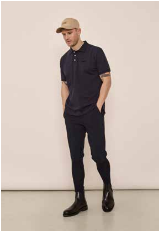
Martin Polo Shirt, Michael Knee Patch Breeches, Mo Cap