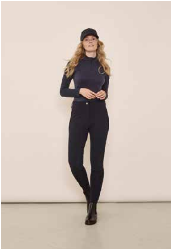
Muse Tech T-shirt, Maria Full Seat Breeches, Mo Cap