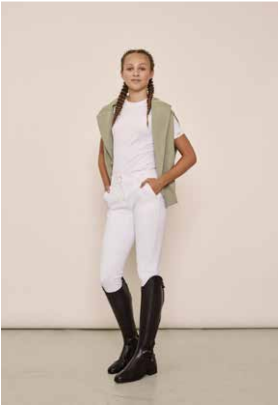
Melisa Sweatshirt, Malin Tech T-shirt, Mila Knee Grip Breeches