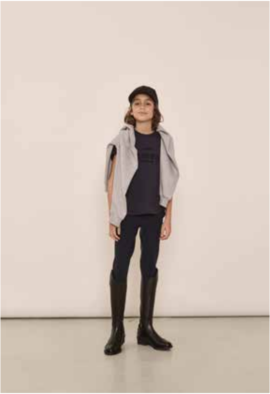
Marley Jr. Sweatshirt, Mustang Jr. T-shirt, Maya Jr. Full Grip Breeches