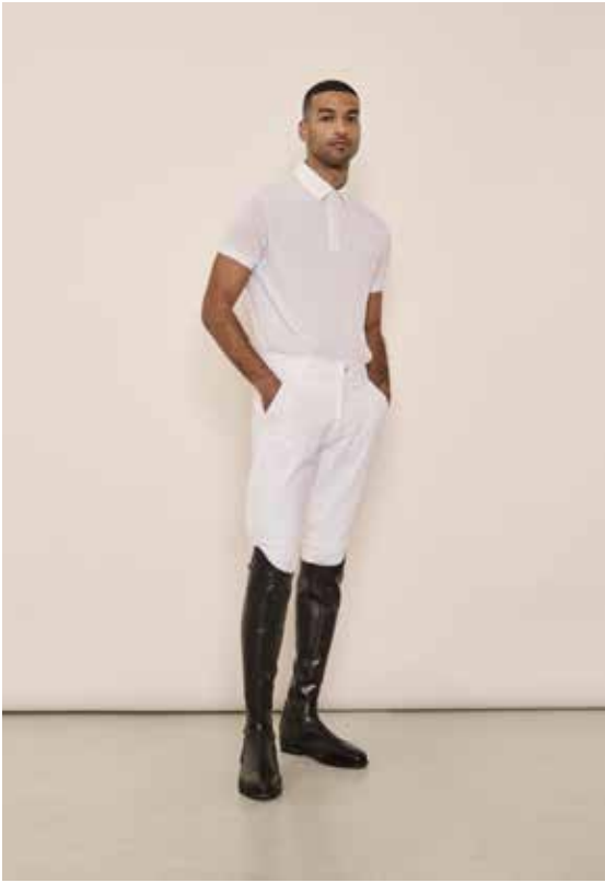
Malcome Competition Polo Shirt, Michael Knee Patch Breeches