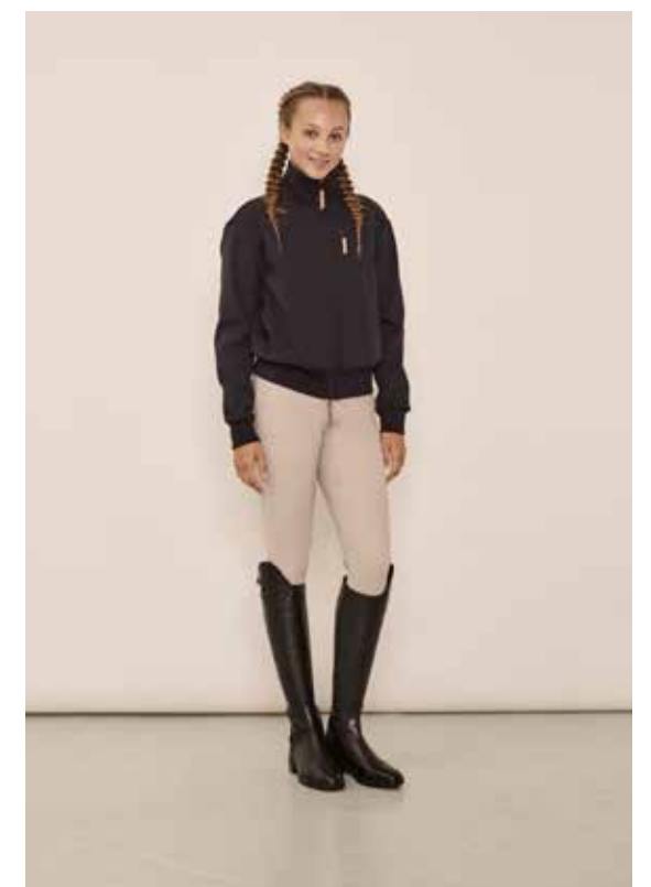
Mai Softshell Jacket, Mila Full Grip Breeches