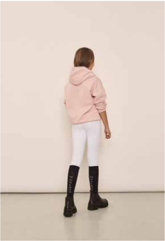
Marley Jr. Sweatshirt, Merle Jr. Knee Grip Tights, Milo Socks