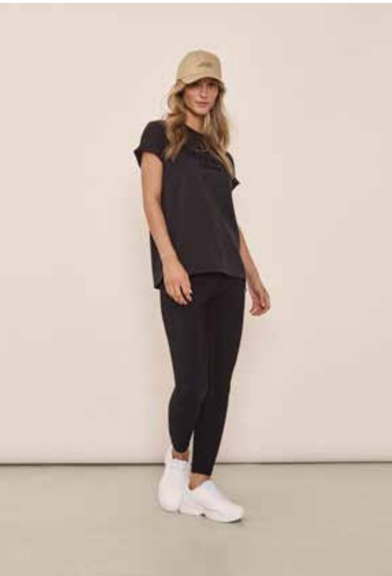
Mustang Unisex T-shirt, Maria Full Grip Breeches, Mo Cap