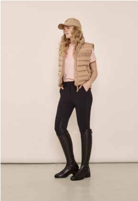
Mica Down Vest, Mustang Unisex T-shirt, Mila Knee Grip Breeches, Mo Cap