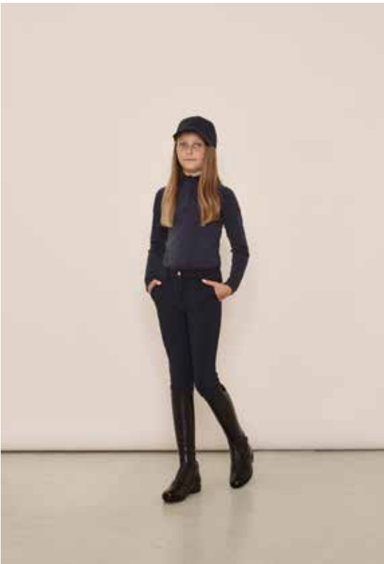
Molly Jr. Seamless T-shirt, Maya Jr. Full Grip Breeches, Mo Cap