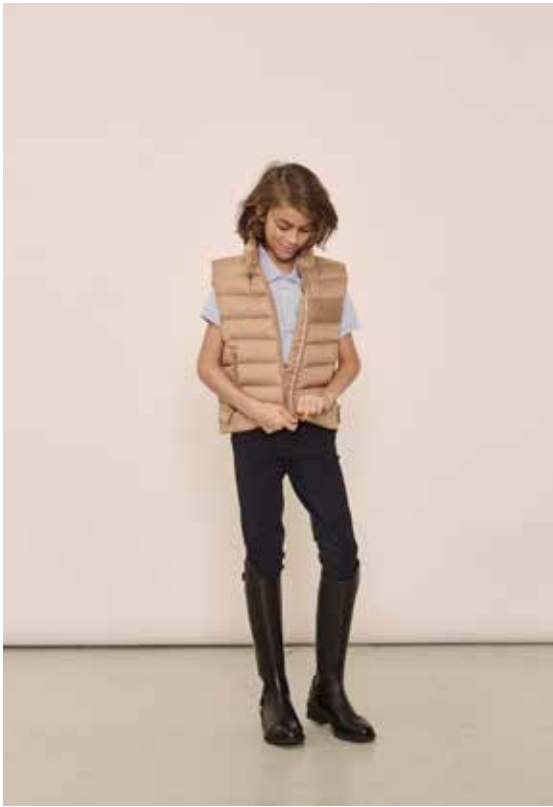
Mischa Jr. Down Vest, Malkit Jr. Polo Shirt, Maya Jr. Full Grip Breeches