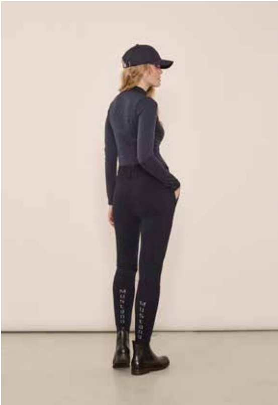
Muse Tech T-shirt, Maria Full Seat Breeches, Milo Socks, Mo Cap