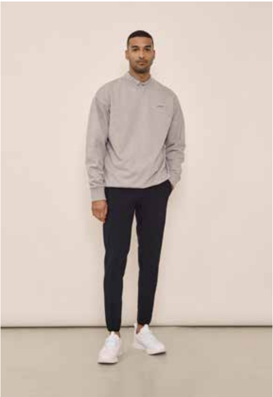
Malthe Crew Neck Sweatshirt, Michael Full Seat Breeches