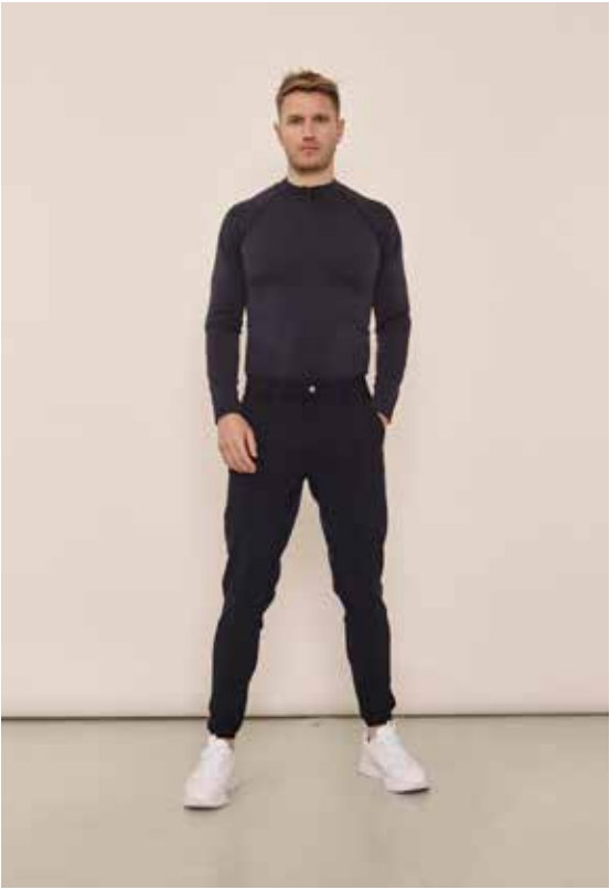
Magnus Tech T-shirt, Michael Full Seat Breeches