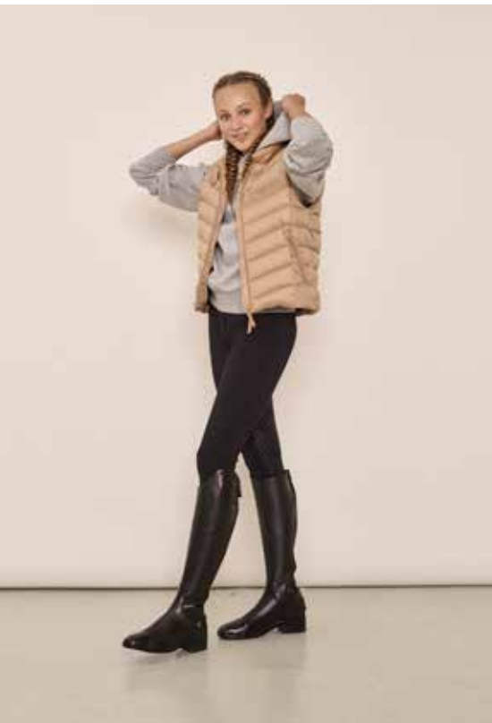
Mica Down Vest, Melisa Sweatshirt, Mila Full Grip Breeches