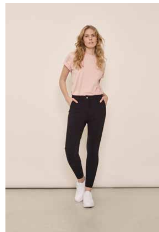
Mustang Unisex T-shirt, Mila Knee Grip Breeches