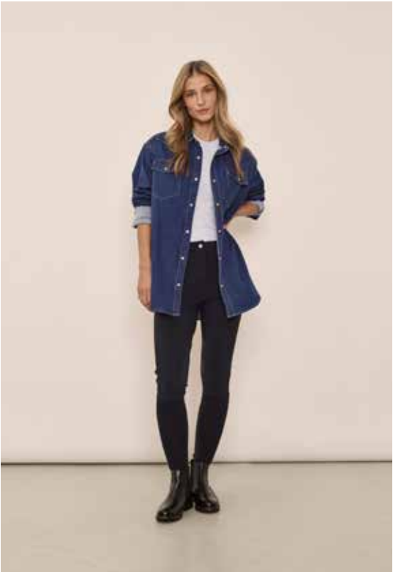
Melvin Denim Shirt, Malin Tech T-shirt, Mila Full Grip Breeches