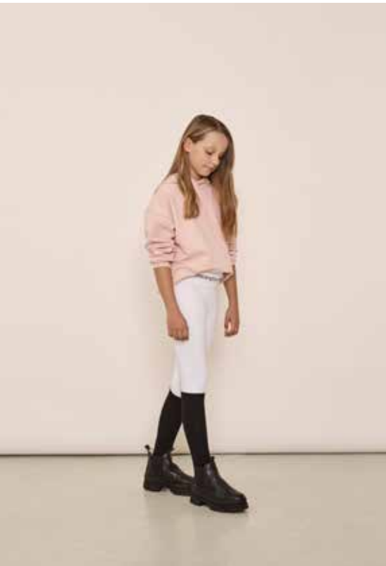
Marley Jr. Sweatshirt, Merle Jr. Knee Grip Tights, Milo Socks