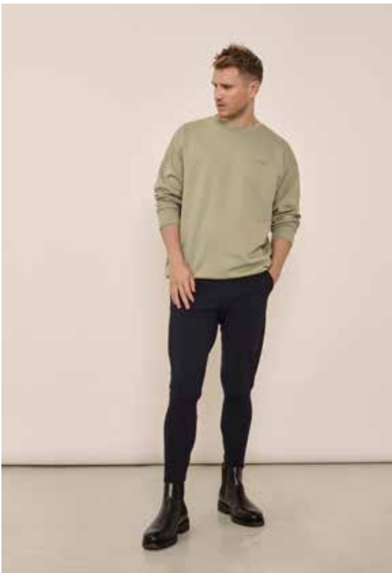
Malthe Crew Neck Sweatshirt, Michael Knee Patch Breeches, Milo Socks