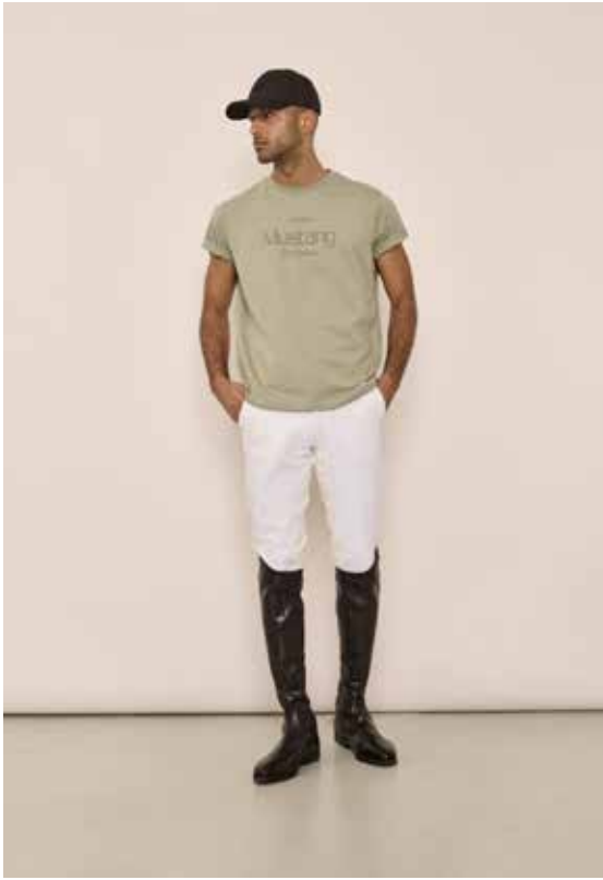
Mustang Unisex T-shirt, Michael Full Seat Breeches, Mo Cap