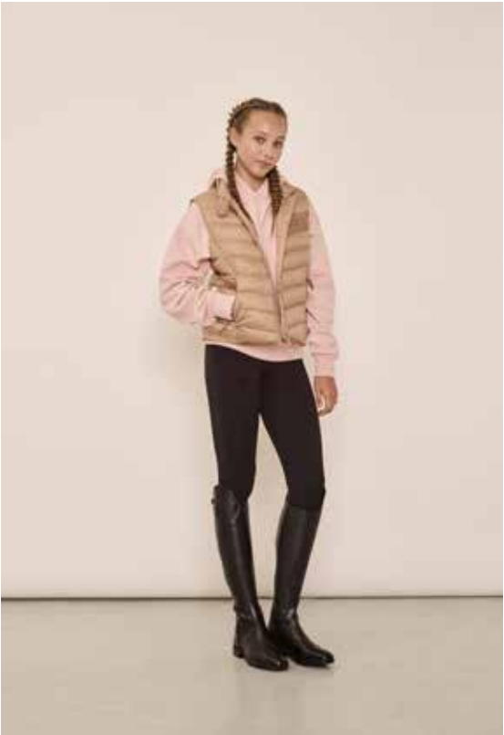
Mica Down Vest, Melisa Sweatshirt, Mia Knee Grip Tights