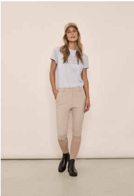
Mustang Unisex T-shirt, Mila Knee Grip Breeches, Mo Cap