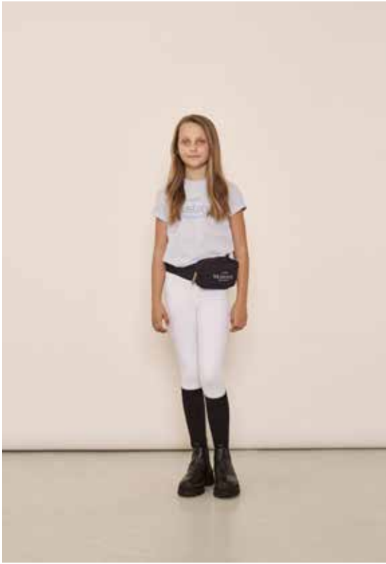
Mustang Jr. T-shirt, Merle Jr. Knee Grip Breeches, Milo Socks