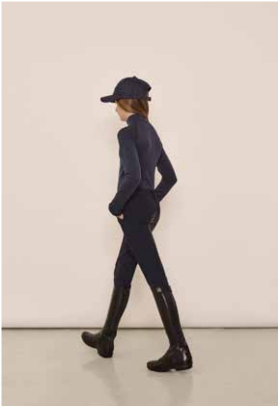
Molly Jr. Seamless T-shirt, Maya Jr. Full Grip Breeches, Mo Cap