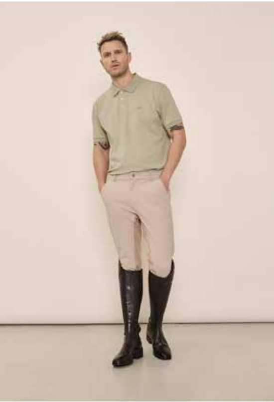
Martin Polo Shirt, Michael Full Seat Breeches