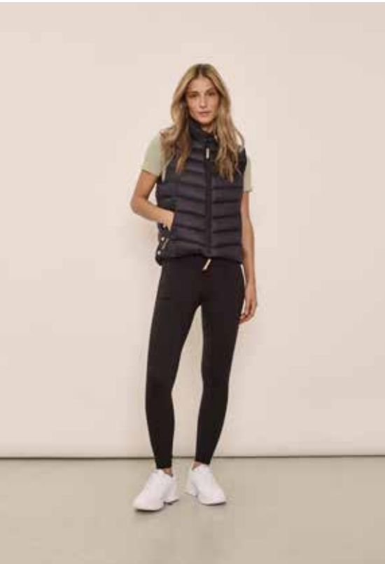
Mica Down Vest, Malin Tech T-shirt, Mia Full Grip Tights