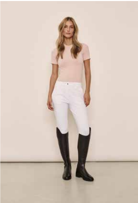
Malin Tech T-shirt, Mila Full Grip Breeches