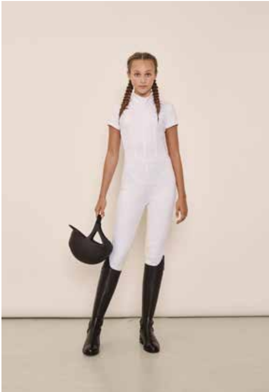
Mille Full Seat Bodysuit