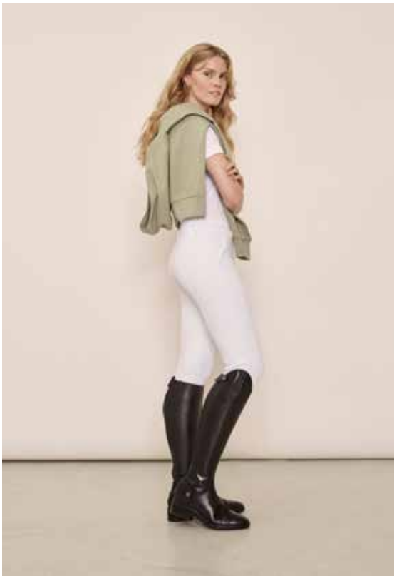
Melisa Sweatshirt, Malin Tech T-shirt, Mila Full Grip Breeches