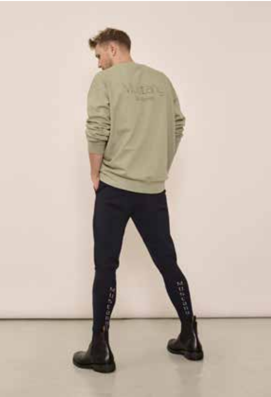
Malthe Crew Neck Sweatshirt, Michael Knee Patch Breeches, Milo Socks