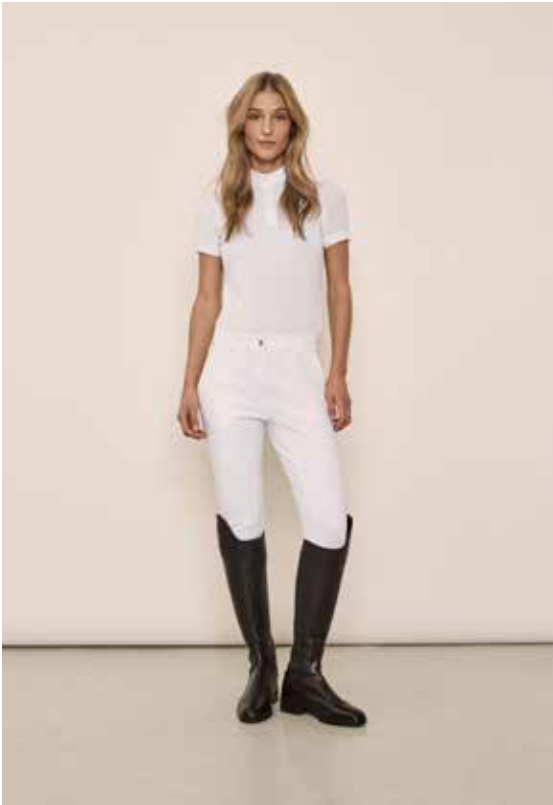
Malina Competition Polo Shirt, Mila Full Seat Breeches