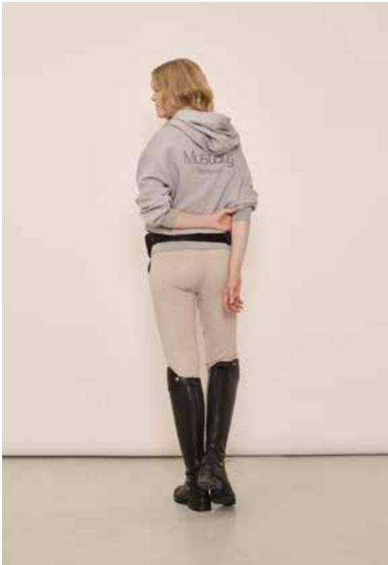
Melisa Sweatshirt, Mila Full Grip Breeches, Mali Bag