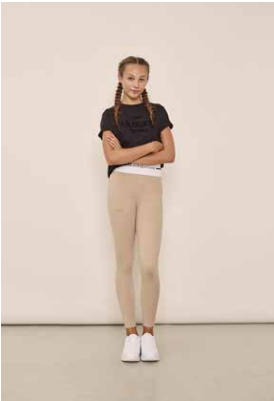
Mustang Unisex T-shirt, Mia Knee Grip Tights