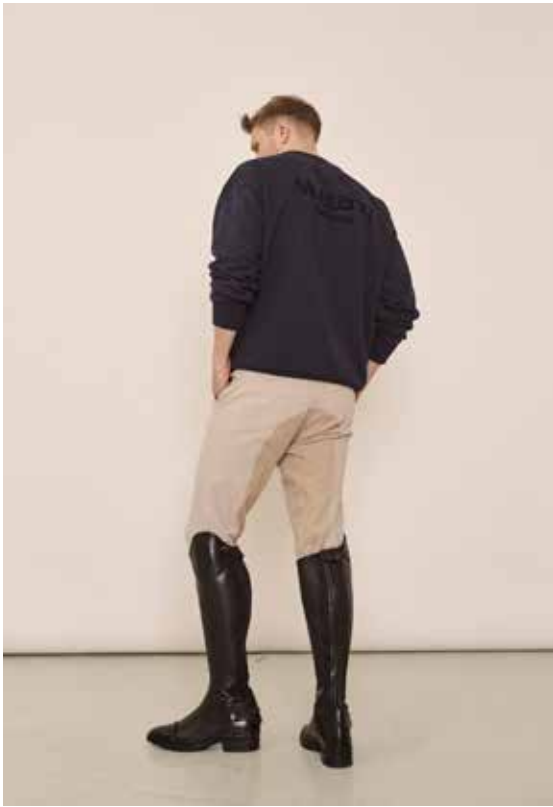
Malthe Crew Neck Sweatshirt, Michael Full Seat Breeches