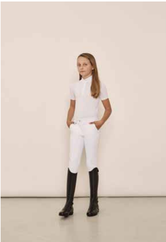
Mira Jr. Competition Polo Shirt, Maya Jr. Knee Grip Breeches