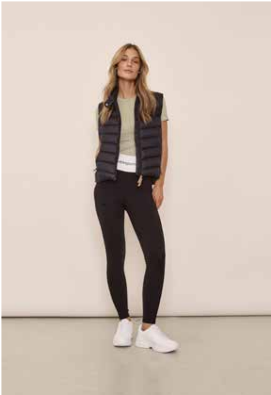
Mica Down Vest, Malin Tech T-shirt, Mia Full Grip Tights