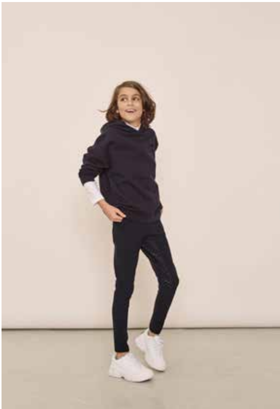
Marley Jr. Sweatshirt, Maya Jr. Full Grip Breeches