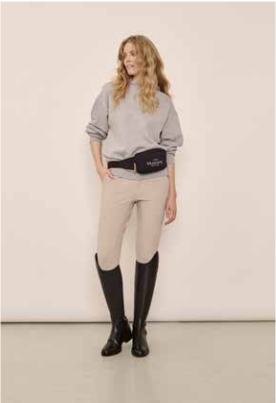
Melisa Sweatshirt, Mila Full Grip Breeches, Mali Bag