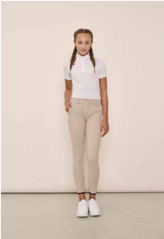
Malina Competition Polo Shirt, Mila Knee Grip Breeches