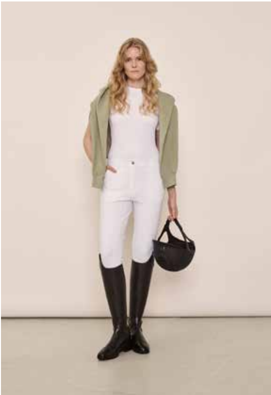
Melisa Sweatshirt, Malin Tech T-shirt, Mila Full Grip Breeches