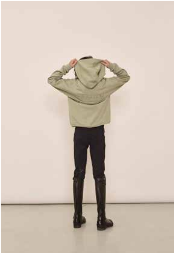
Marley Jr. Sweatshirt, Maya Jr. Knee Grip Breeches