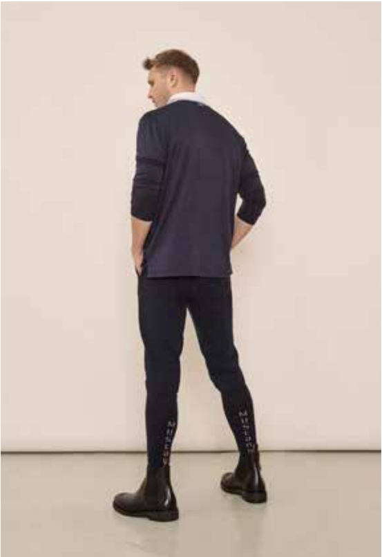
Malcome Competition Polo Shirt, Michael Full Seat Breeches, Milo Socks