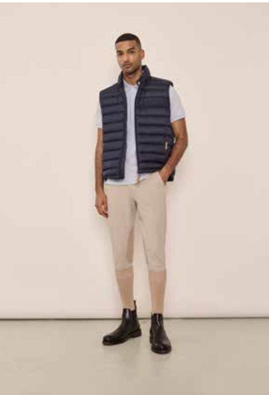
Mark Down Vest, Martin Polo Shirt, Michael Knee Breeches, Milo Socks