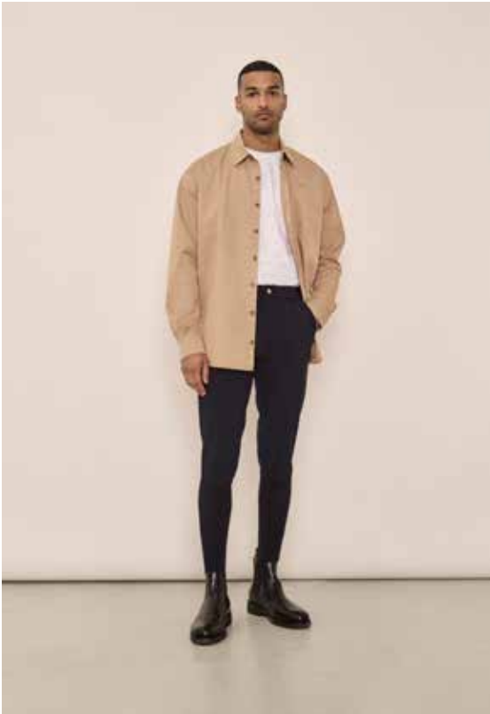
Marcus Twill Shirt, Mustang Unisex T-shirt, Michael Full Seat Breeches, Milo Socks