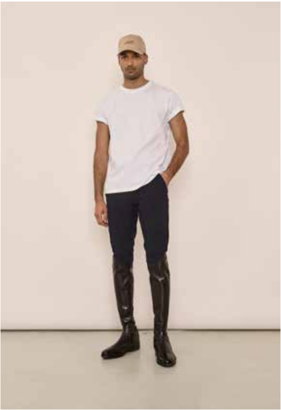
Mustang Unisex T-shirt, Michael Full Seat Breeches, Mo Cap